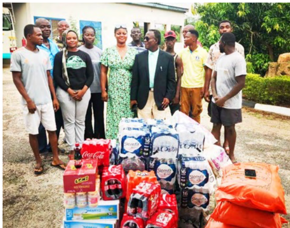
Donation – JL Properties, Accra

At the end of last year, PPRC donated about 40,000 GHS worth of food and drink to multiple beneficiaries, including Enyinndakurom, outreach clients, and PPRC staff. These donations are highly valued in these challenging times.