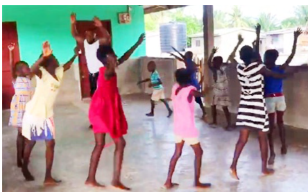
Enyinnda Dance Sessions