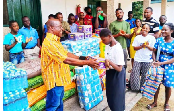
Donation – New Bethel Revival Ministry Int. Amsterdam