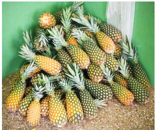
Pineapples harvested from the farm