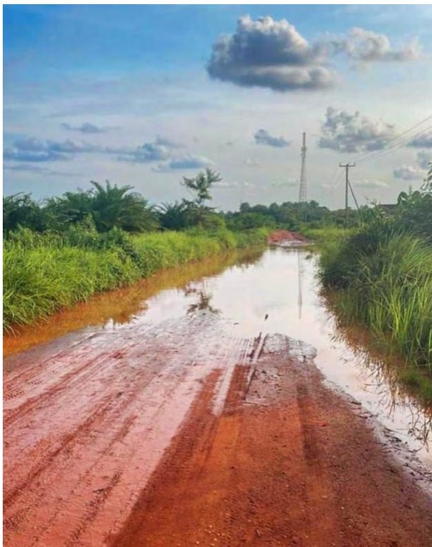
Local Roads – Flooded