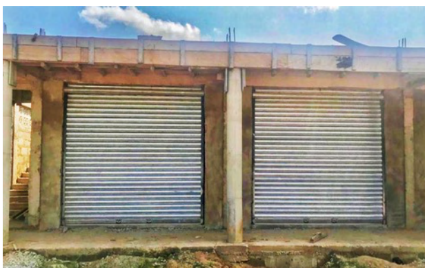
Two Shop Fronts – Doors Installed