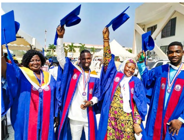
PPRC Staff Graduating