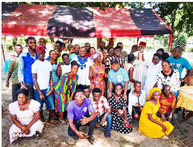
PPRC Christmas Party with Archbishop Palmer-Buckle (Dec-2023)