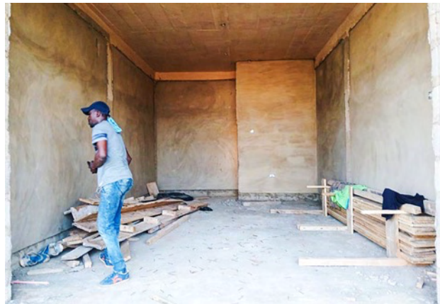
Enyinnda Shop interior – Plastered

the KEEA Municipal Sanitation Department to improve the community's water and sanitation. A new borehole, biodigester and upgraded toilet facilities are being considered. We will be seeking funding to start this project in August. We have also taken action to curtail land encroachment at Enyinndakurom.