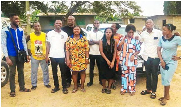
PPRC Staff, World Leprosy Day, Enyinnda

skills training in beadwork and have recently trained ten children. We expect these training activities will improve the prospects of all those involved.