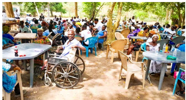
New Year's Party fully sponsored by the BBF Foundation, Cape Coast