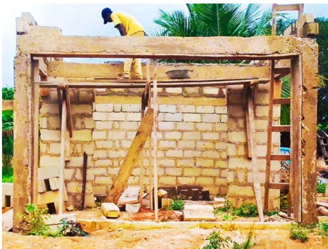
Anita’s Shop under Construction

Anita is determined to achieve her goal of independent living in keeping with PPRC’s policy. Located in Twifo Aboabo in the