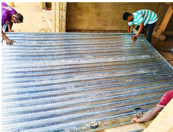
Roller Door Installation