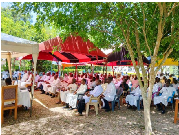
Archdiocese Day of Lenten Recollection