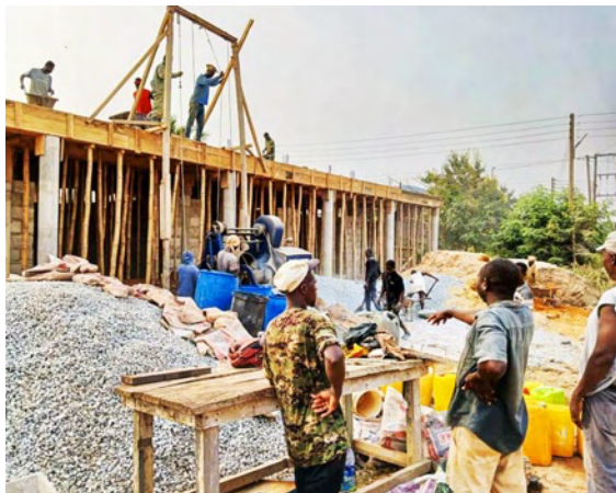
Shops Under Construction