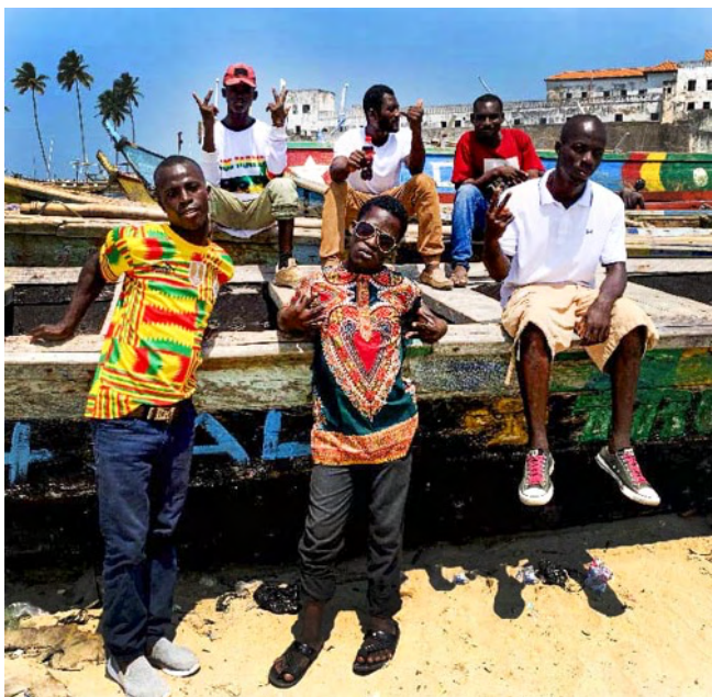
St Elizabeth's at Bakatue Festival, Elmina

We've set up a learning room for six young adults, focusing on foundational subjects such as mathematics, language skills, and science. Unfortunately, our ICT program has been delayed due to staffing shortages.