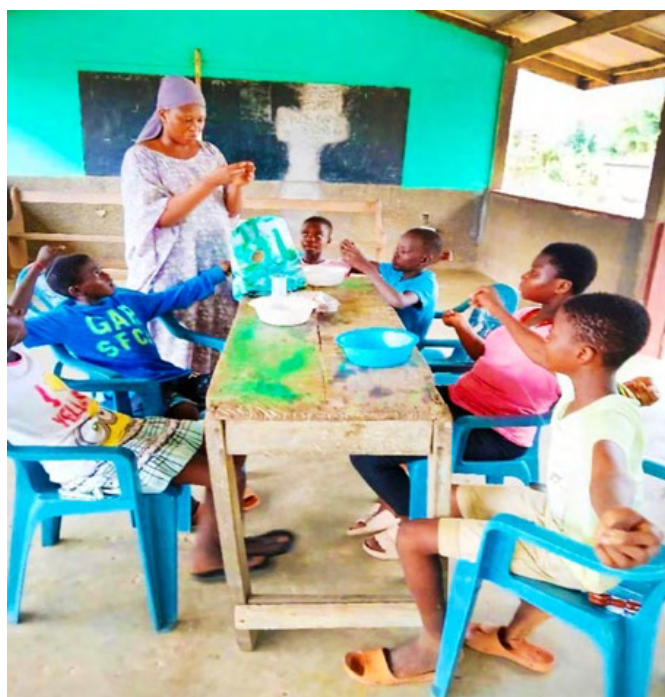
Arts & Crafts – St. Elizabeth's