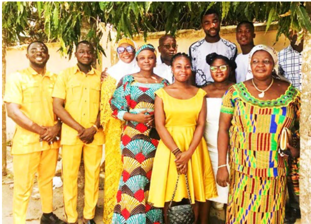
PPRC Staff going to a Wedding