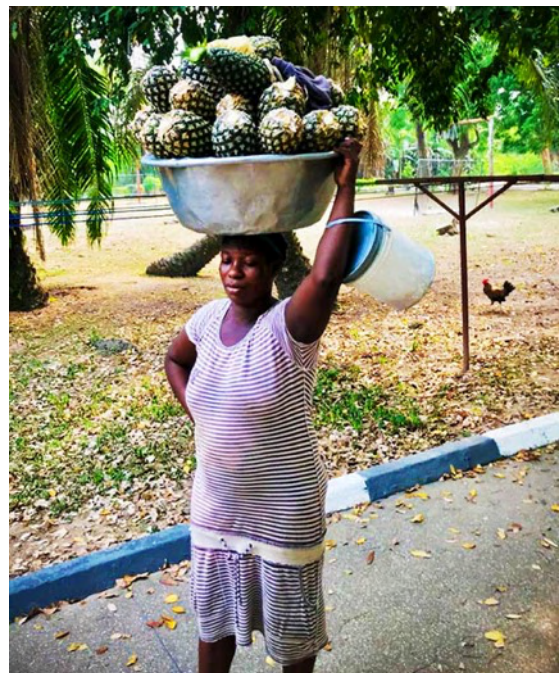
Local Pineapple Vendor

The recent rains, essential for growing the vegetables we need, have raised our hopes for a good farming season. We are