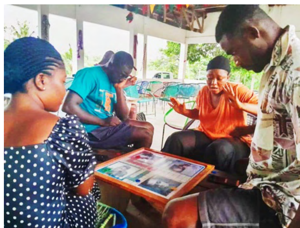
Games in St. Clare's