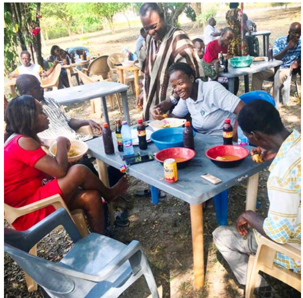
Enjoying the party