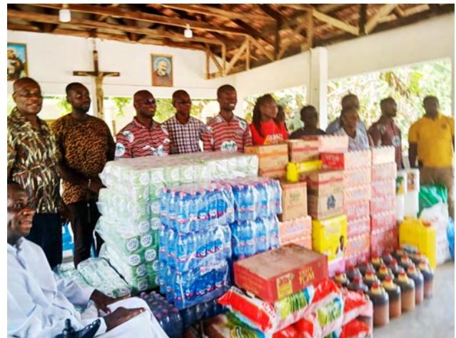
Donation – Twifo Oil Palm Plantation

In 2024, we were blessed with many local groups and individuals donating in cash and in-kind. These donations are greatly appreciated, as they help us provide our core services. We recently received generous donations from the Muslim Communities in Cape Coast and the Fire & Prisons Services Officers.