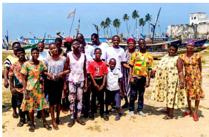
St Elizabeth's at Bakatue Festival, Elmina