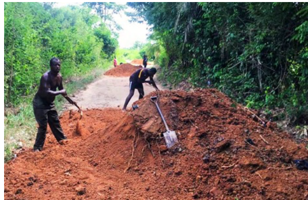
Repairing Local Roads near Ahoto

(~€2,500). Over the years, PPRC has contributed significantly to repairing these roads. The most recent repairs were assisted by sponsorship from our good friend, Sr. Lisa SSJ. We plan to install culvert pipes in two of the worst affected areas to help improve the road.