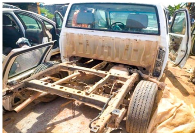
White Pickup – Major Repairs