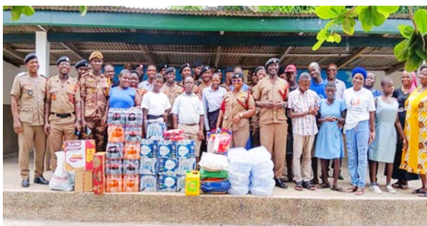
Donation – Prison & Fire Officers of the Muslim Fraternity