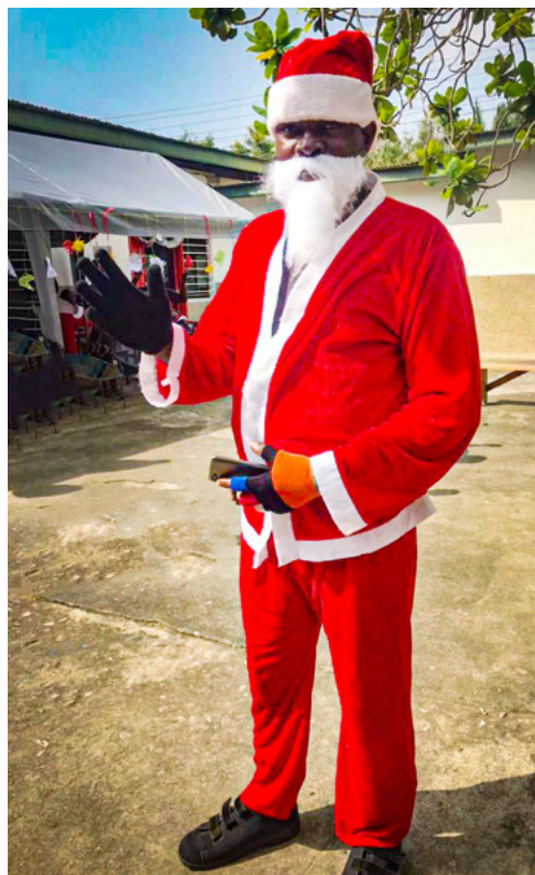
Santa made a special appearance