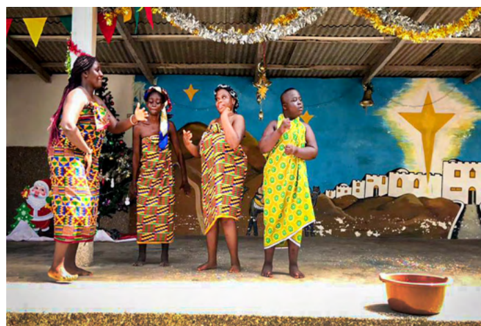
Nativity Play 8-Dec-21