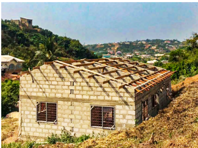
Quad's New House in Moree Village