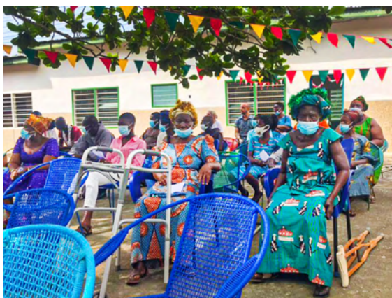
Audience – Outdoors + Socially Distanced

Major preparations were underway for many weeks as the season's highlight rapidly approached. Everyone had a great time on Dec-8th, and the play went off without a hitch.