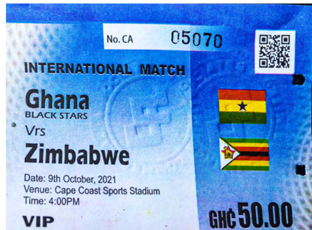
Ticket for the Zimbabwe Match

You'll be glad to hear that it's not 'all work and no play' for our volunteers and interns. On Oct-9th, some of them attended an international soccer match in Cape Coast – Zimbabwe vs. Ghana. We're happy to report that Ghana won 3-1. On Nov-30th, we had a local football match between a team from Ahoto, including many volunteers, and a team from Kiful. Thankfully, Ahoto won the game.