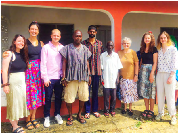
Volunteers meeting the Chief of Abee