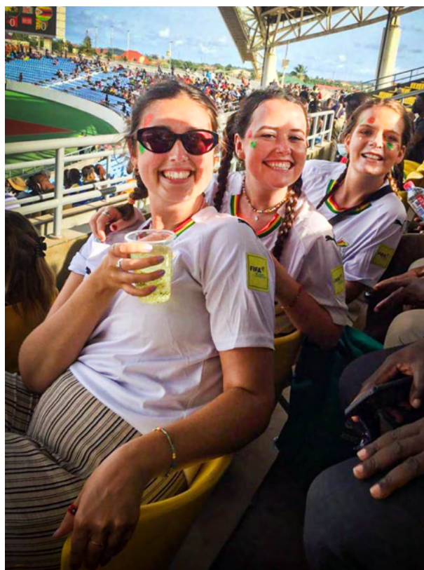
Irish Volunteers at the Zimbabwe Match