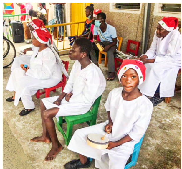
Nativity Angels waiting in the wings