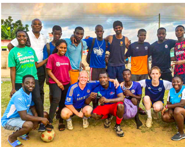
Ahoto Team that beat the Kiful Team

The Winneba students are also assisting in St. Elizabeth's, St. Clare's, and the Sheltered Work program.