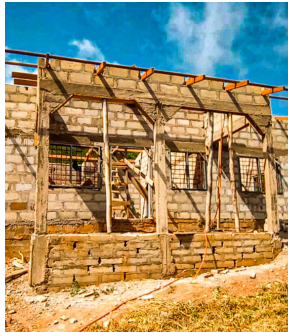
Work in Progress – Front Elevation